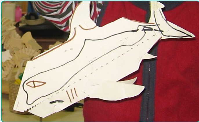
Sharks with teeth and moving jaws